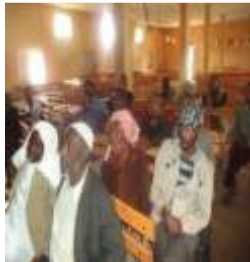
Gera Woreda Men and Women FGD Participants- PIC-1