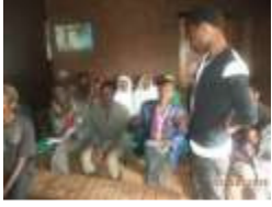
Yayu Community Consultation-1