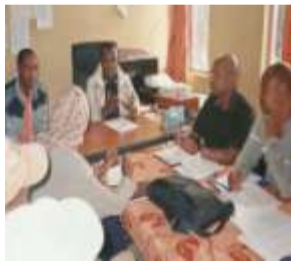
Dodola Woreda Consultation Participants-2