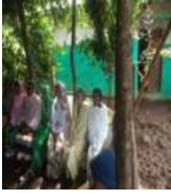
Gera Woreda Men and Women FGD Participants- PIC-2