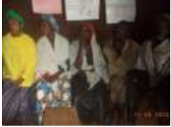
Yayu Community Consultation-2